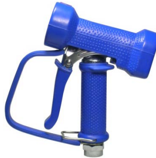
AKCNP01-B blue AKCNP01-W white AKCNP01-W-U* white