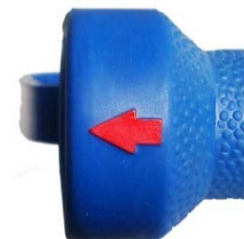
Red arrow for jet direction

*** Although all materials used can withstand temperatures up to over 100 °C, it is strongly recommended to take special precautions when using hot water.