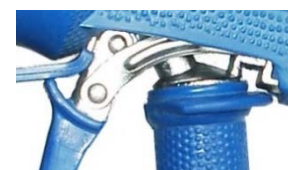
Rubber collar for better protection

Spray guns for lance mounting, for autoclave and explosion safe.