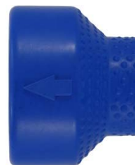
Arrow for beam direction

*** Although all materials used can withstand temperatures up to over 100 °C, it is strongly recommended to take special precautions when using hot water.