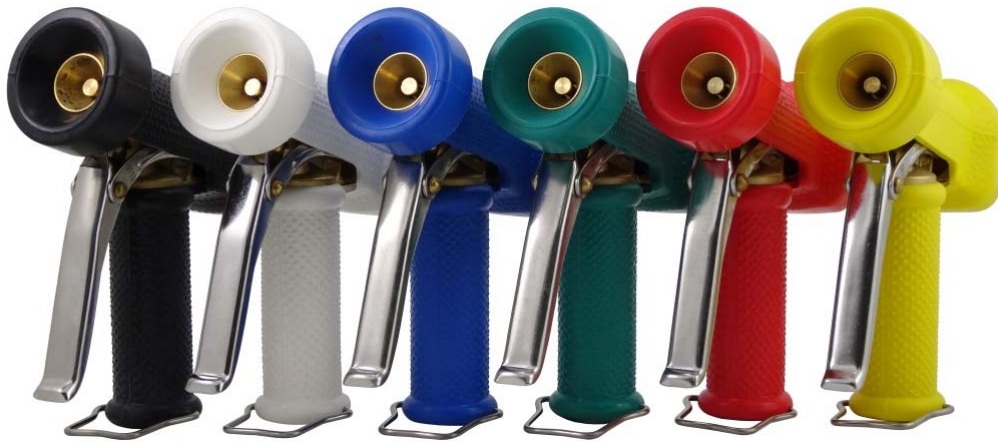
KLMN001-BL black KLMN001-B blue KLMN001-R red KLMN001-W white KLMN001-G green KLMN001-Y yellow

All bold printed items are ex. Stock available