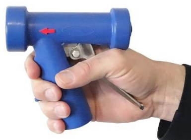
Clear red arrow to show the water beam direction

All bold printed items are ex. Stock available