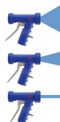
Water beam controllable from broad beam to strong jet