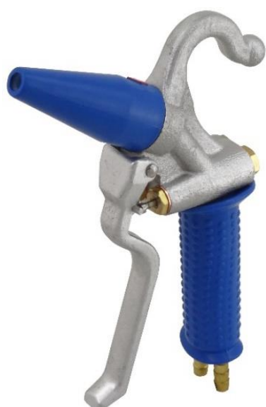
Article number: AKAWLU1-B

The gun is made of cast aluminium and has a blue rubber handle and nozzle. The operating lever opens and closes both the water and air supply.