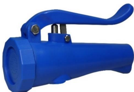
Article number: AKKS003-B

Ergonomically shaped, lightweight hand shower for rinsing meat, vegetables, etc. The shower is made of high-quality plastic with high resistance to chemicals. Its design makes it comfortable to hold and has a good grip.