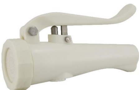
Article number: AKKS003-W

Matching hose tails with EPDM O-ring (order separately)