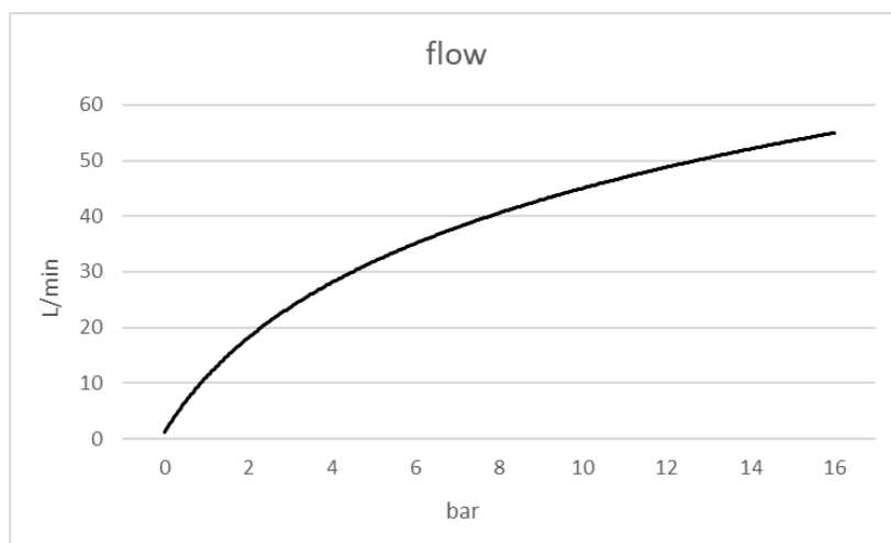
Water flow in L/min at fully opened nozzle, depending on pressure