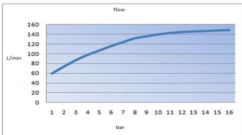
Water flow in L/min at fully opened nozzle, depending on pressure

All bold printed items are ex. stock available