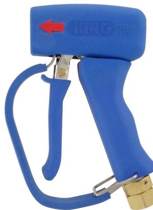
AKMNP11-B-SW12 with trigger guard and swivel 1/2" BSP fem.

All article numbers in bold are available from stock.