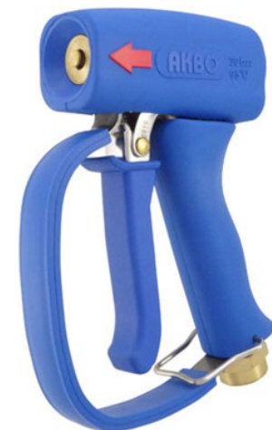
AKMNP11-B with trigger guard