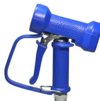
AKCNP01-B blue with trigger guard