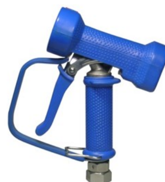
AKCNP01-B-SW12 (blue) with swivel 1/2" BSP female