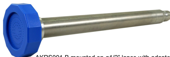
AKRS001-B mounted on ø1/2" lance with adapter