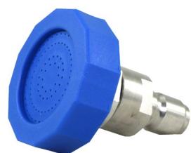
AKRS001-B mounted on adapter for fast changing

Although all materials can handle temperatures up to 80 °C, special precautions are recommended if hot water is used.