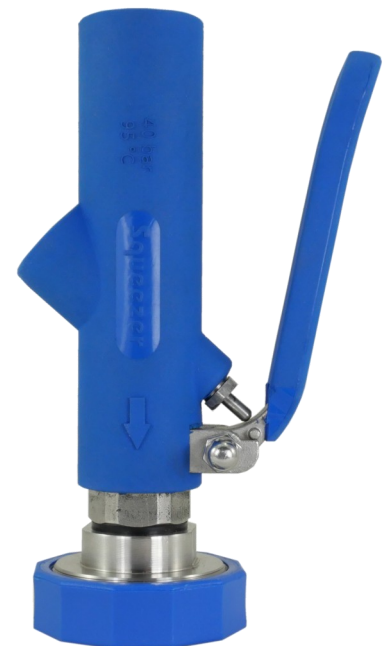
AKRSV01-B + AKRS001-B (blue)

All article numbers in bold are available from stock.