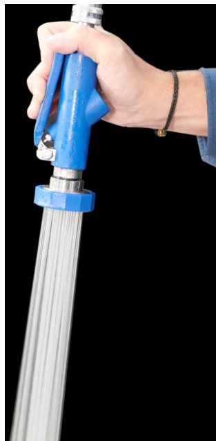
The picture above shows the shower head mounted on the Squeezer at 2 bar. It has a straight spray pattern.