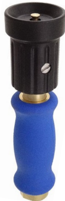
AKMSHL1-B (Brass, head with blue grip GRIPML1-B)